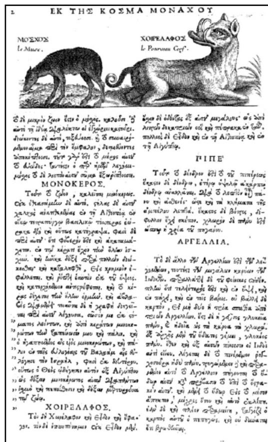
Fig. 1: Depiction of a χοιρέλάφος in Melchisédech Thévenot's Relation de divers voyages curieux (1663), 1: 2 44 .

tion between the parts of the body. Furthermore, the image is strictly associated with the caption, which has no realistic support within the image. In other terms, images in Thévenot's work show animals as if they were taxidermic specimens, exposed in a labeled glass box (Fig. 1).