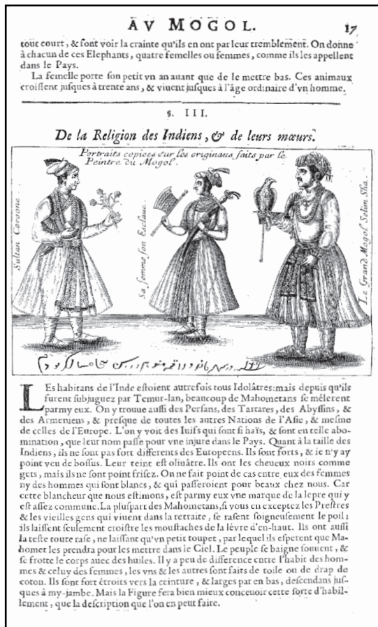
Fig. 2: Depiction of Indian costumes in Melchisédech Thévenot's Relation de divers voyages curieux (1663), 1: 17.

out their veracity. In the Voyage de Terri au Mogol 52 , for instance, one of the engravings shows this interesting label: “Portraits copied on the originals, executed by the Painter of the Mogul 53 ” (Fig. 2).